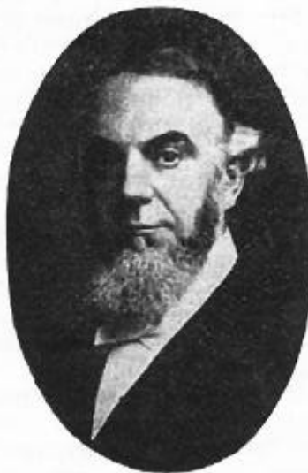
Brother C. T. Russell.

The world considers this work book selling. No other book has been excluded from the bookstores, public press, etc. as much as the Dawn, yet no other book has had such a sale. It is the Lord's doings and marvelous in our eyes. This work is preaching, making known the glad tidings in the most effective manner.